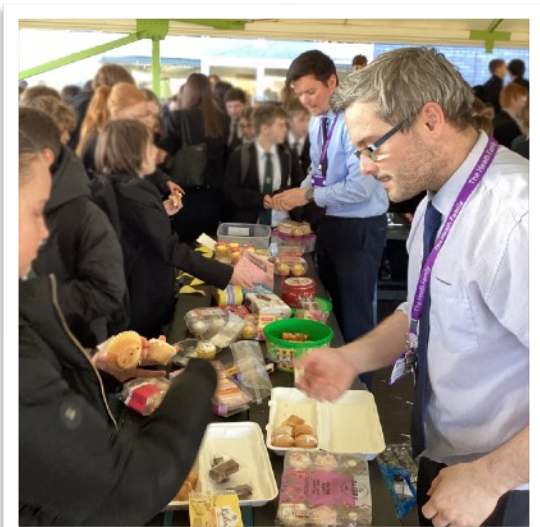
Overall House Points